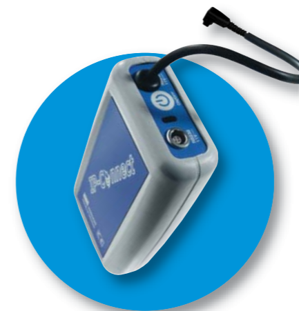
IP Connect Pack