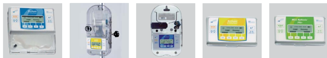
Rythmic™ Evolution Fits Full set 200 ml